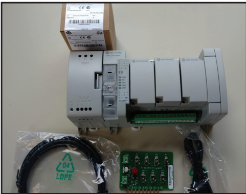
Rockwell –Allen Bradley Micro 850

WHAT..... You will program the PLC (pictured below). It is yours to keep to continue practicing on, or set it up as a demonstration for others.